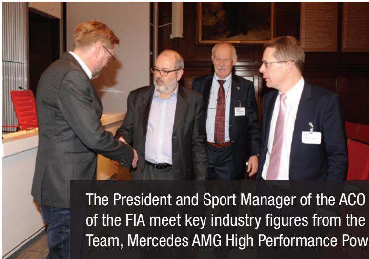
The President and Sport Manager of the ACO and Technical Director of the FIA meet key industry figures from the Porsche Motorsport LMP Team, Mercedes AMG High Performance Powertrains and Audi Sport